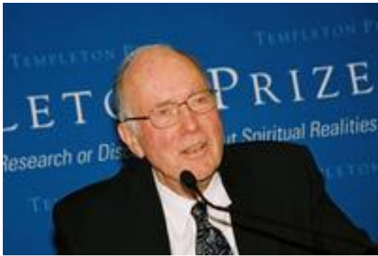
Charles H. Townes

Qr: Is He a transcendental personality beyond the influence of material nature ?